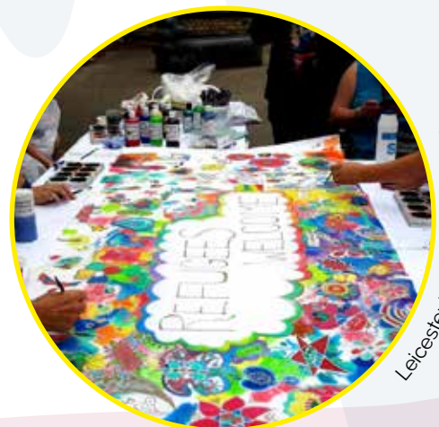
Leicester New Walk Museum

• There not being appropriate material available to buy for new arrivals: this is a difficult issue to resolve, but the developing network via Libraries of Sanctuary will mean that libraries can share information about sources, and also, if required, put joint pressure on publishers to produce more relevant material