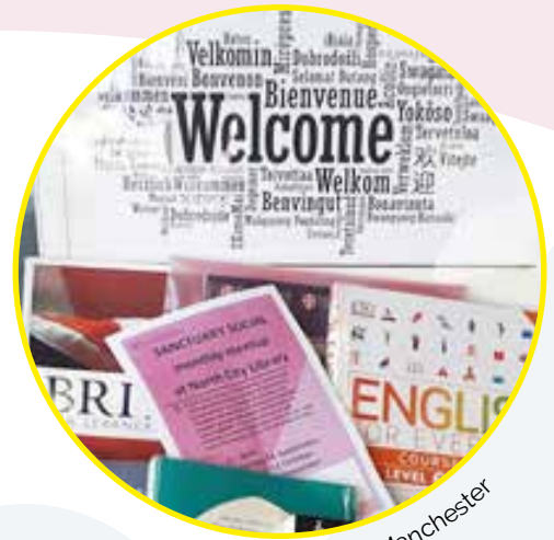
North City Library, Manchester

Some of the main barriers to the take-up of library services by new arrivals – and examples of overcoming them – are: