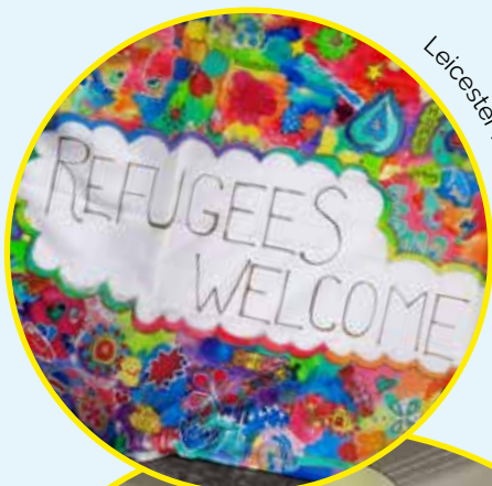
Leicester New Walk Museum