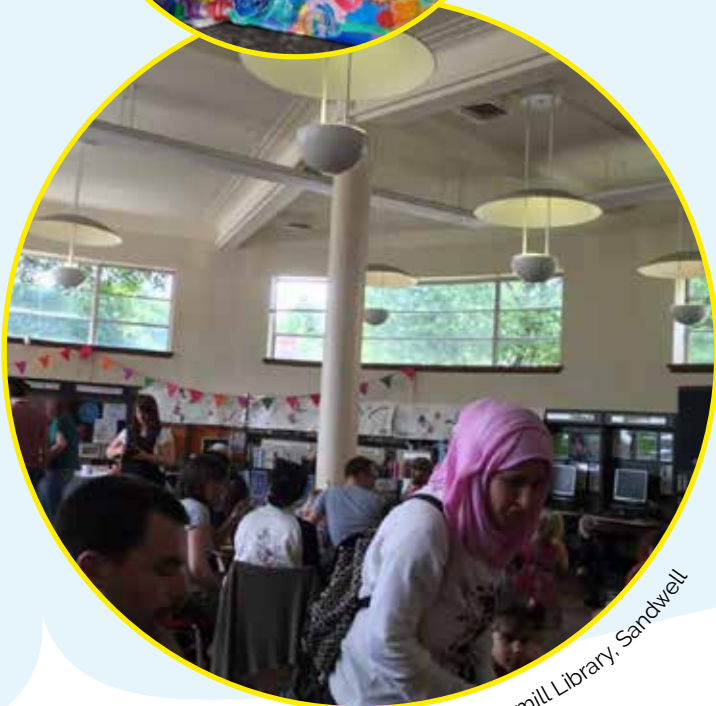
Thimblemill Library, Sandwell