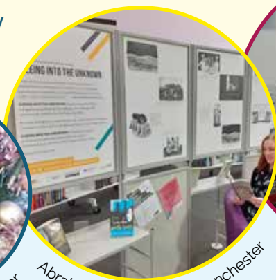
Abraham Moss Library, Manchester