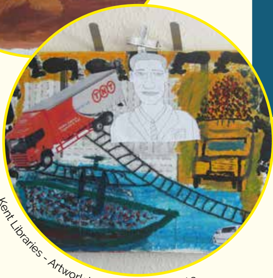
Kent Libraries - Artwork by Gmalem Goneste

'What amazing pictures, I love them' Ruby, aged 6