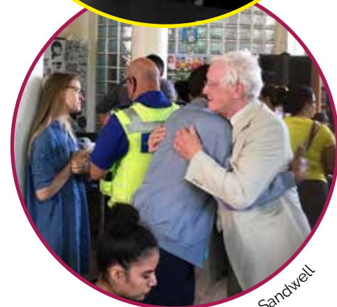
Thimblemill Library, Sandwell