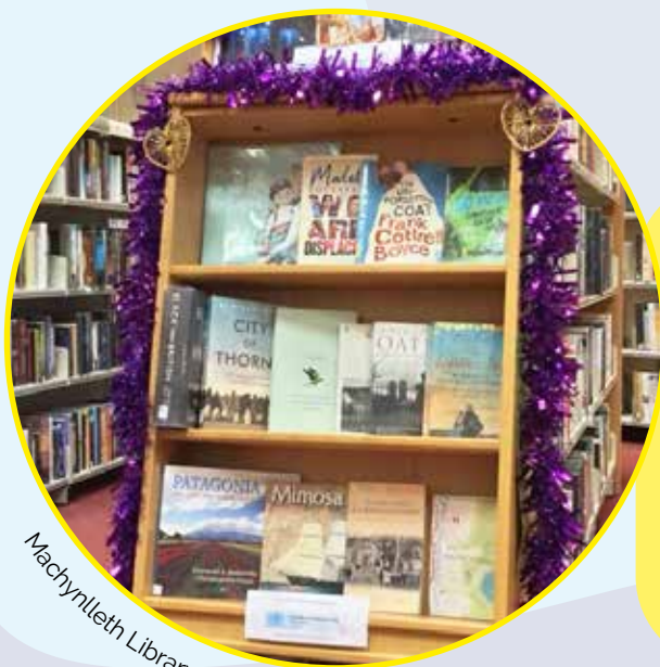
Machynlleth Library, Powys

In this resource pack, we mainly use this term to refer to all refugees, people seeking asylum or others forced to migrate from any background. This is to combat the dehumanising rhetoric which can occur when referring to people by their immigration status.