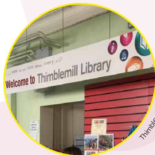
Thimblemill Library, Sandwell

• Attitudes of other library users: this is one of the most difficult barriers to overcome, but many libraries organise events and activities where people can meet and begin to mix socially (and library staff are also clear about their role should something unpleasant be said). Book displays and collections telling the stories of people seeking sanctuary help to raise awareness and empathy