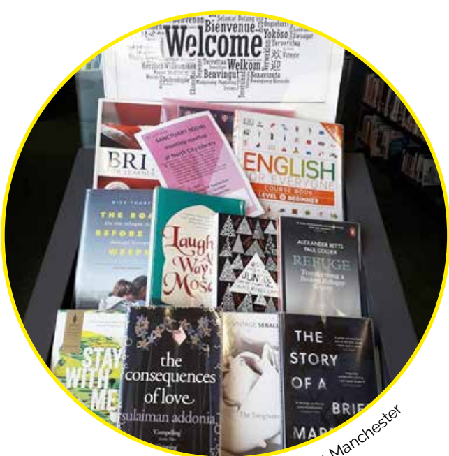
North City Library, Manchester

Norwich received its first five Syrian families in February 2017 – Norfolk Library and Information Service's Millennium Library hosted the induction training programme for volunteers.