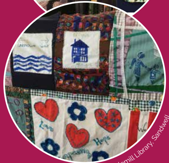
Thimblemill Library, Sandwell