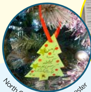
North City Library, Manchester

Library staff have engaged with many people in conversation about the issues around migration, asylum-seeking and refugees. People said that, as refugees, they were looking for access to IT at the Library so they could find news from their countries and get news of friends and relatives. They also saw it as an opportunity to make friends and to keep loneliness and alienation at bay. Coming to the Library offered them help with practising their English, help with paperwork and information about food banks, Citizens Advice sessions and other sources of help such as language classes. In some cases, library staff have found people who have knowledge and experience to impart about previous episodes when people sought sanctuary, such as the Kosovan crisis in the 1990s.