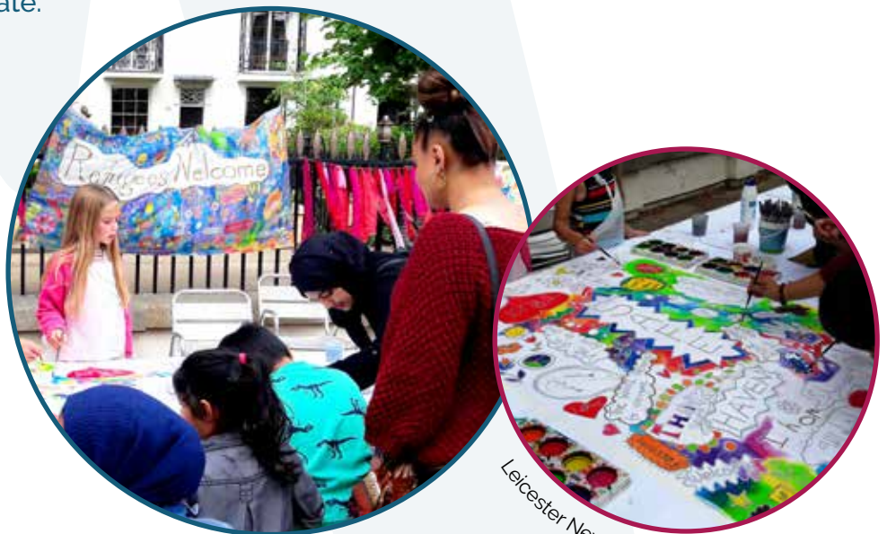
Leicester New Walk Museum

It is always useful to have comments from people seeking sanctuary or other migrants who have engaged with any aspect of the organisation's work.